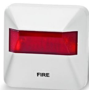
Conventional Remote Indicator